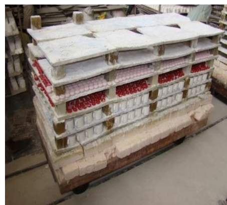
Traditional kiln furniture

Cars are used in tunnel kilns to carry ceramic products during firing, and the kiln furniture includes all the objects and fixtures that are used to support, hold or position ceramic ware/articles in the kiln during the firing process. The dead mass of cars used in the unit was quite high; the ratio of kiln car weight to product was about 3:1. This resulted in (i) higher specific energy consumption (SEC) of about 10.4 Sm 3 per 1000 pieces, and (ii) high push time of the car, of 50–60 minutes.