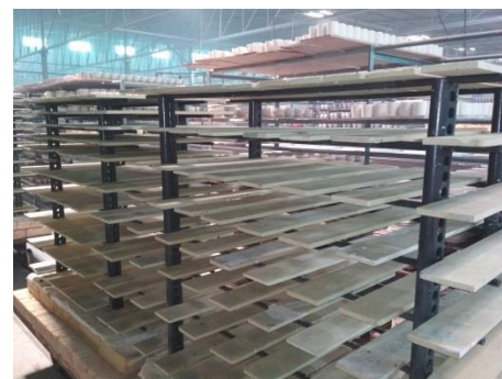
Low thermal mass (silicon carbide) kiln furniture

The unit replaced the high dead-mass refractory brick-based kiln cars by low thermal mass (LTM) cars with silicon carbide (SiC) furniture. The use of low thermal mass material in kiln cars led to a significant decrease in push time of the kiln cars, and increased production rates. However, the fired ceramic products need to adhere to a certain firing cycle in order to avoid cracks in the final products coming out of the kiln. Therefore, the unit increased the length of the kiln from 120 feet (36 metres) to 180 feet (54 metres) that covers preheating, firing and cooling zones.