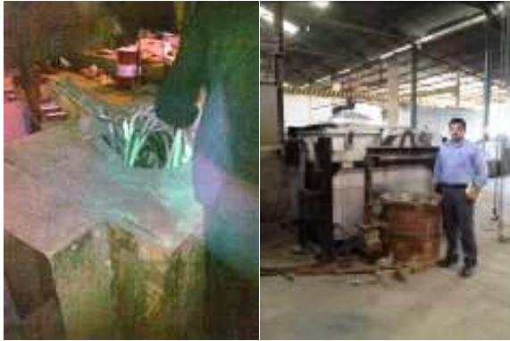
L -Existing small capacity resistance furnace; R - Large capacity resistance furnace

The energy audit revealed that the resistance furnace was consuming less power for melting aluminium than the induction furnace, i.e., it was relatively more energy efficient. However, the resistance furnace was found to be of small capacity (200 kg), and hence the unit was in the practice of melting some of the required aluminium in the induction furnace leading to overall increase in energy consumption.