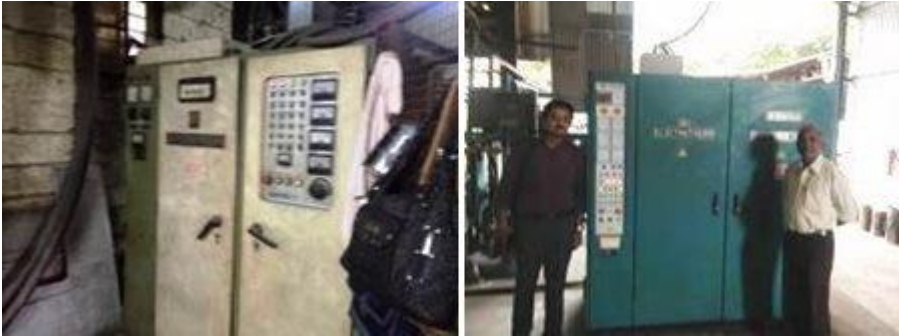
L-Inefficient induction furnace; R - EE induction furnace

The unit was operating an induction furnace with rated capacity of 350 kW and crucible capacity of 500 kg. The specific energy consumption (SEC) of this induction furnace was calculated at 820 kWh/tonne of molten metal, which was relatively high for this category of furnaces. Also, considering the fact that the unit produces small castings, the large crucible capacity of the existing furnace increased the holding time and resulted in significant energy losses.