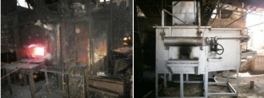
L-Inefficient forging furnace; R - Energy efficient forging furnace with automatic control systems

The unit was operating an FO-fired forging furnace of capacity 250 kg per hour, associated with 1 tonne hammer having a very low thermal efficiency level of 7.1%. The furnace operation required exhaustive maintenance. Heat losses due to improper combustion of fuel, flue gas losses and surfaces losses due to damaged and worn refractory of furnace walls were quite significant in the furnace. The specific energy consumption was estimated to be 202 litres of FO per tonne of job which is comparatively high.