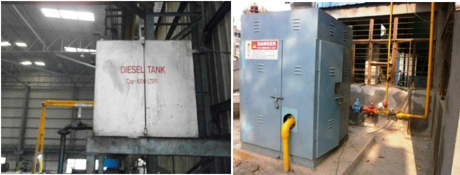
Fuel switch from HSD (L) to natural gas (R) for painting oven, water heater and pre-treatment tank

The unit was operating an HSD-fired painting oven, water heater and pre-treatment tank. The energy audit revealed that the specific energy cost of heating was very high. With natural gas (NG) being readily available in the cluster, the unit was advised to switch from using HSD to NG for these systems.