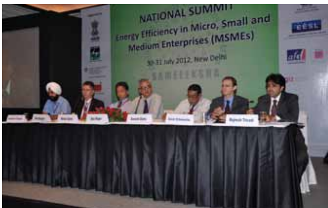
Panelists at the Finance session

Trade (PAT) scheme may be extended to MSMEs as ‘Designated Clusters’ for mass impact.