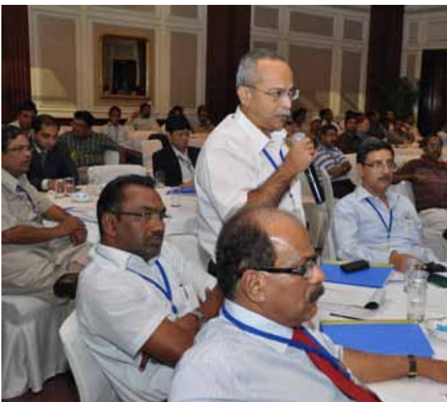
Setting the theme - interactions among participants