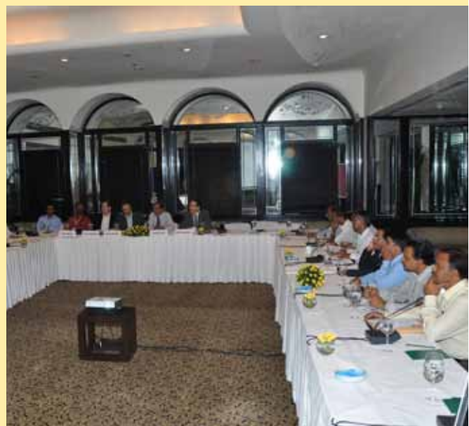
Promoting Indo-French cooperation among MSMEs

A visit to the identified clusters by experts and representatives from technical centres of excellence in France, e.g. CETIAT (French Technology Centre), would help in (i) deepening the understanding of the technologies and practices at cluster level, (ii) identifying areas for performance improvements and (iii) developing strategies for interventions.