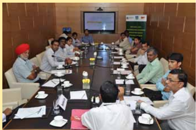
Project dissemination workshop