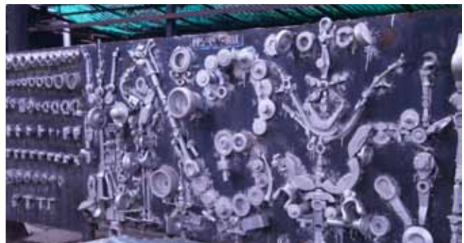
Closed-die forged components

The gross annual turnover of the forging MSMEs in Pune is estimated at Rs 500–600 crores (about USD 300 million), while that of the heat treatment MSMEs is Rs 80–100 crores (about USD 60 million). The production levels of the units range between 500–3500 tonnes per annum (tpa). The production levels have shown a downward trend in recent times, due to the slowdown