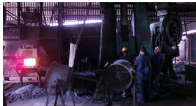
Furnace oil fired forging furnace